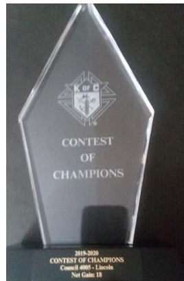
Contest of Champions trophies awarded to Lincoln Council for percentage increase (l) & net gain (r)