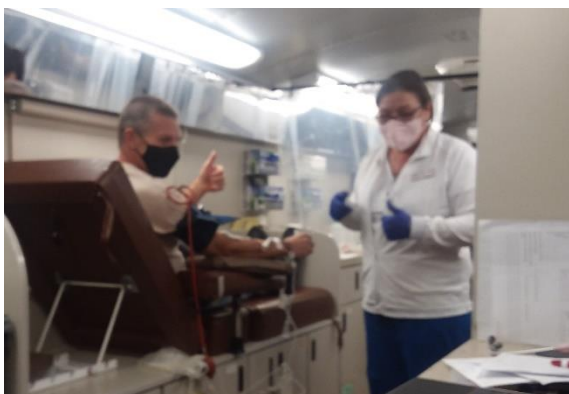
One of the 21 donations at Lincoln's Blood Drive

Lincoln Council held a Blood Drive November 2 nd (yes, yesterday) where 21 pints were collected (see photo below).