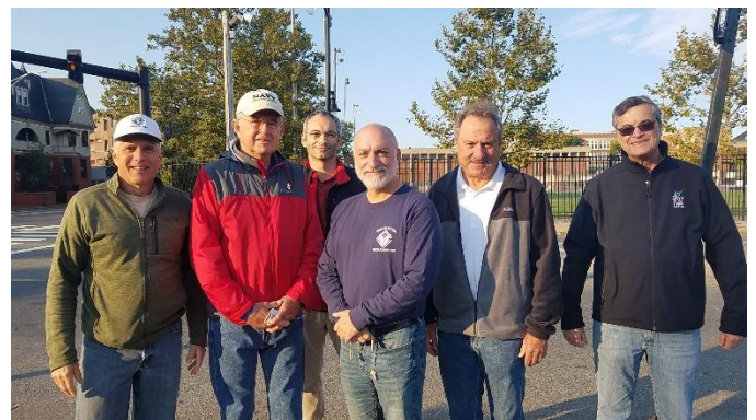
Members of Bristol & Fr. Donnelly Councils at the 40 Days for Life Campaign

The Fall Forty Days for Life Campaign ran through November 1st. While the active campaign is completed, we should continue to pray for the cause. We will let you know about the Spring campaign when it is closer.