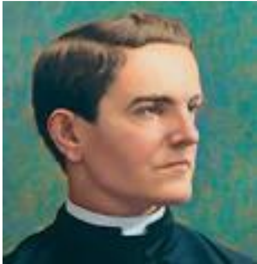
Newly Beatified Fr. Michael McGivney